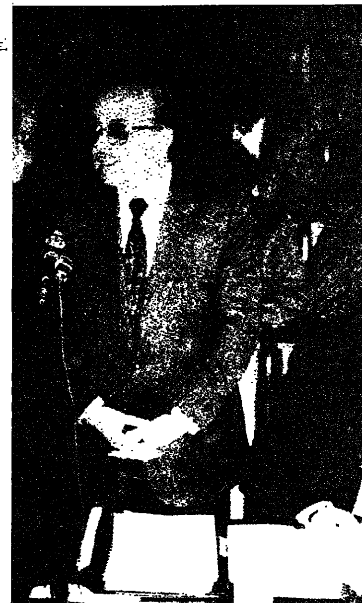
Prime Minister Mudar Badran at Monday's NCC session.

"My treatment was courteous: the officers, the soldiers and even the prisoners were so kind.